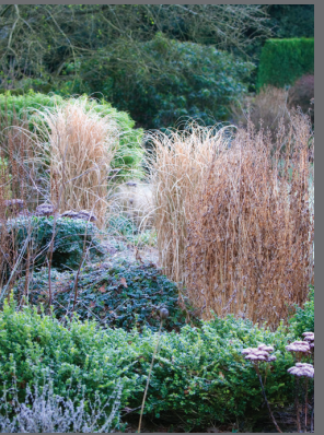
Garden in winter 'Mallorn'